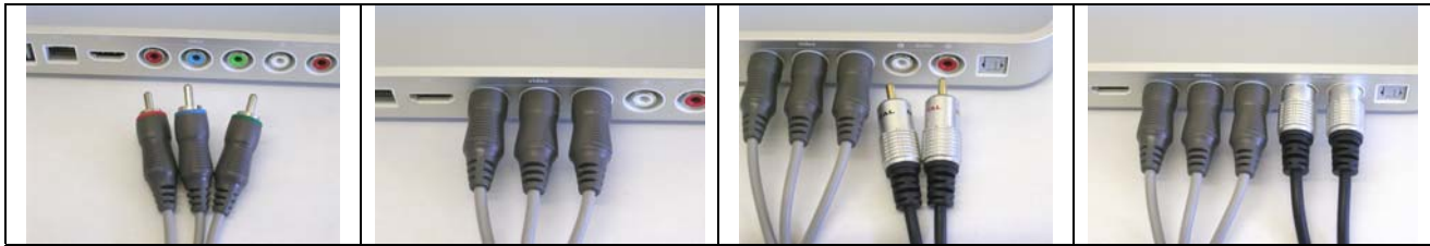
Making the connections for Video and Audio on Apple TV.

The leads from Apple TV are then connected to the Component (YUV) to RGB / VGA Converter.