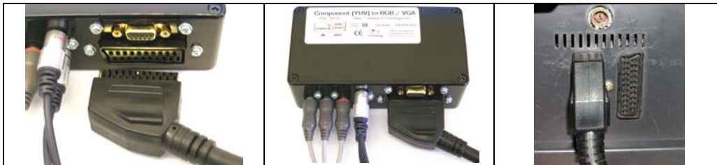
Using a SCART lead from the converter to the TV.

The Converter is then connected to the display TV via the SCART connection.