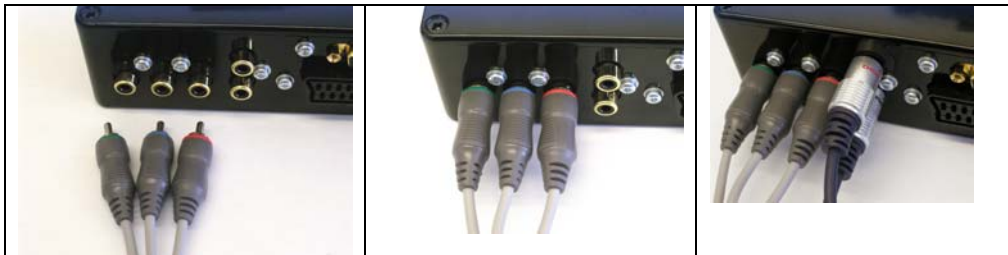
Connecting leads from Apple TV to the Converter.

The leads from Apple TV are then connected to the Component (YUV) to RGB / VGA Converter.