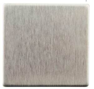
Satin Stainless Steel