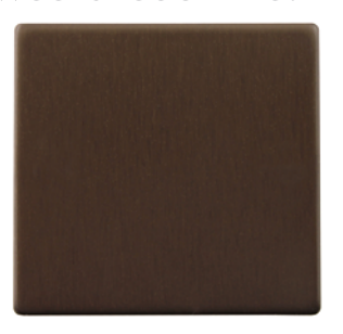
Bronze Satin Stainless