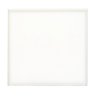
Prism Clear Acrylic